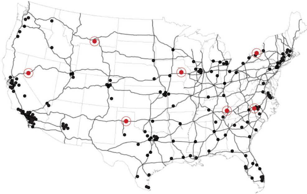
Figure 2: Relationship between U.S. mid-sized cities and the interstate highway system. Cities marked in red have been preliminarily identified for detailed examination. They are listed below.