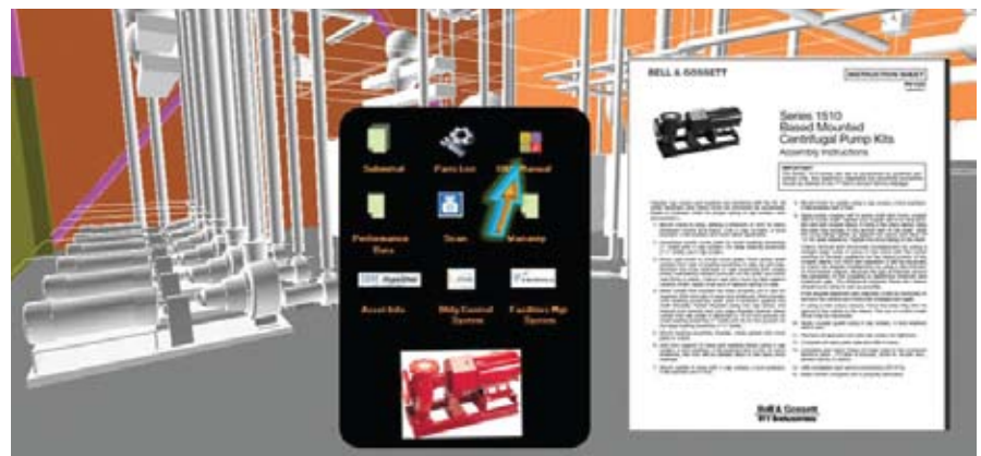
Figure 1. The concept for using wireless devices connected to a BIM Portal at Sandia Labs.

Accurate information is a key factor in decision making. It's not easy to synthesize the impacts from a stack of spreadsheets but good data married to 3D BIM makes the information actionable. Crate and Barrel now has 50 of 152 stores modeled in BIM. The models are continually updated to reflect project-related adjustments.