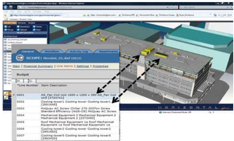
Figure 2. Visualization of asset data from the ERP System.

Before assigning too much credit to software efforts, let's not forget that the primary reason BIM has garnered so many accolades is because of the enormous process changes that have paralleled the development of technology. And much like the process that unfolded as design and construction teams learned to